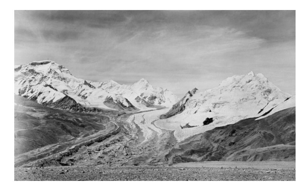
Kyetrak Glacier 1921. Location: Cho Oyu, 8201 m, Tibet Autonomous Region; Eastern Himalayas . Elevation of Glacier: 4,907 – 5,883 m.