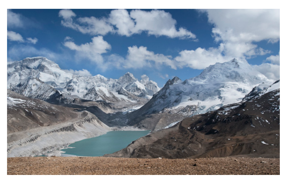
Kyetrak Glacier 2009