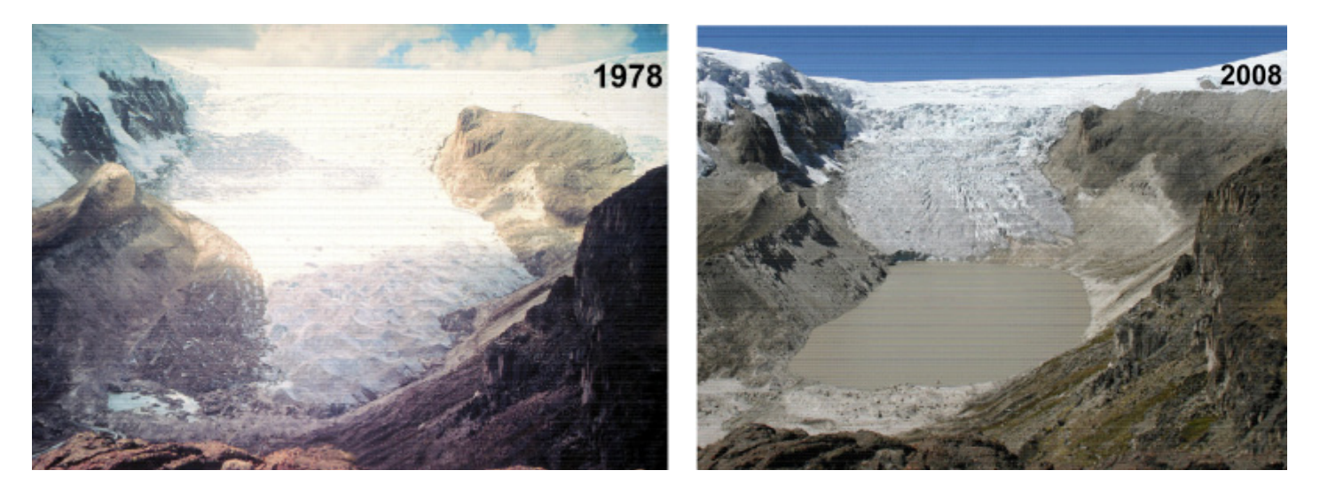
Qori Kalis outlet glacier (the largest outlet glacier from the Quelccaya Ice Cap in the southern Andes of Peru).

Mountain glaciers are lethally vulnerable to ongoing climate change